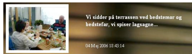
Figure 2: Example of a picture showing the other family members. The note says, "We are at the terrace at grandmother and grandfather, we are eating lasagna"

The children found it difficult to identify relevant and interesting motives. At our second interview, one of the children expressed "I want to take pictures. It's just hard to find things to photograph" . The other children expressed the same problem. They did not feel that they could find anything that would be of interest for their parents. Because of this, most of the children forgot to take pictures. When they did take pictures, it was often "just the best thing I could find when I remembered to take a picture" . The lack of feedback in eKISS between the children and their parents could possibly explain some of these problems. The children received no immediate response from the parents or from any peer children on the pictures taken. Our findings indicate that the lack of information on responses to the pictures made it difficult for the children to assess when to take pictures and in what situations.